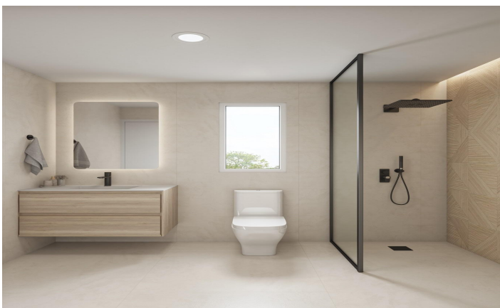
VIVIENDA TIPO B ESCALA 1/100